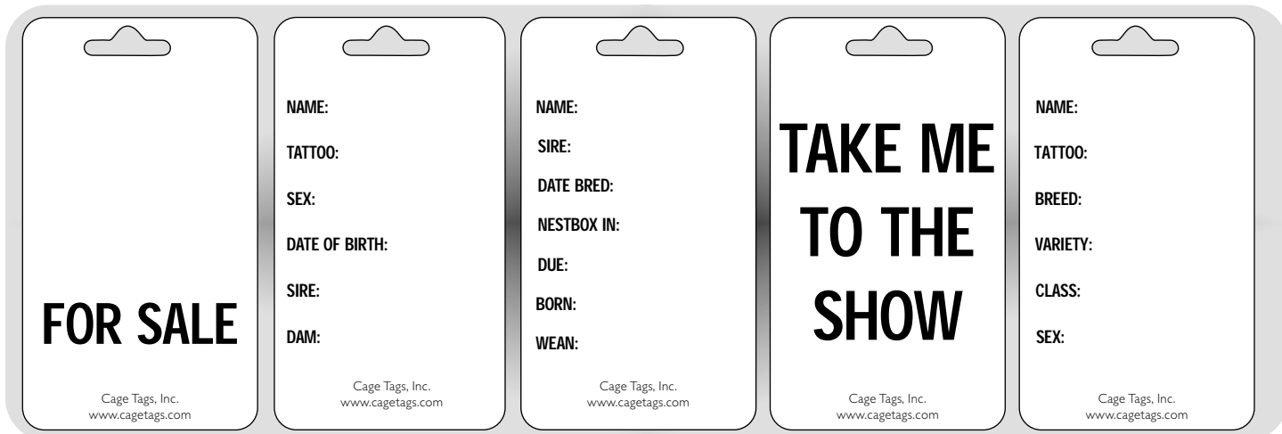
07 - Show Carrier