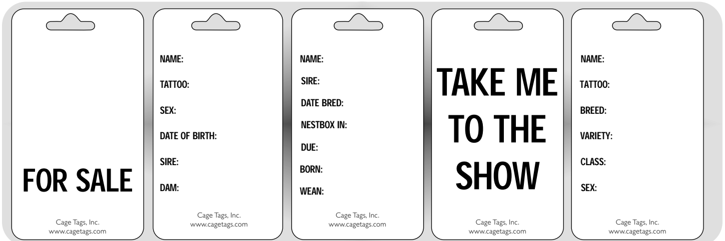
07 - Show Carrier